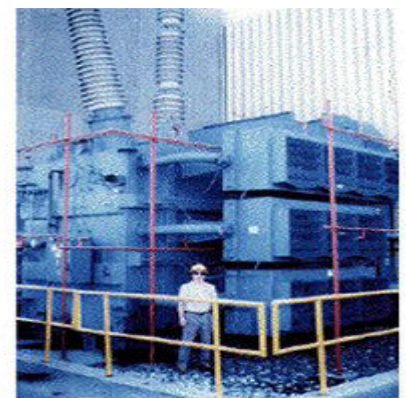
PJM Public Service Step Up Transformer Severe internal damage caused by the space storm of 13 March, 1989

"In the 160-year record of geomagnetic storms, the Carrington event is the biggest." It's possible to delve back even farther in time by examining arctic ice. "Energetic particles leave a record in nitrates in ice cores," he explains. "Here again the Carrington event sticks out as the biggest in 500 years and nearly twice as big as the runner-up."